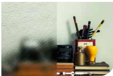
Privacy Level 5