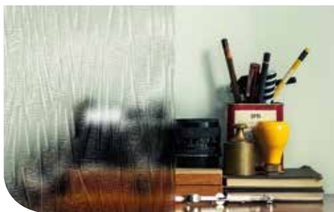
Privacy Level 4