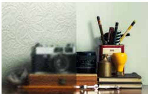
Privacy Level 2