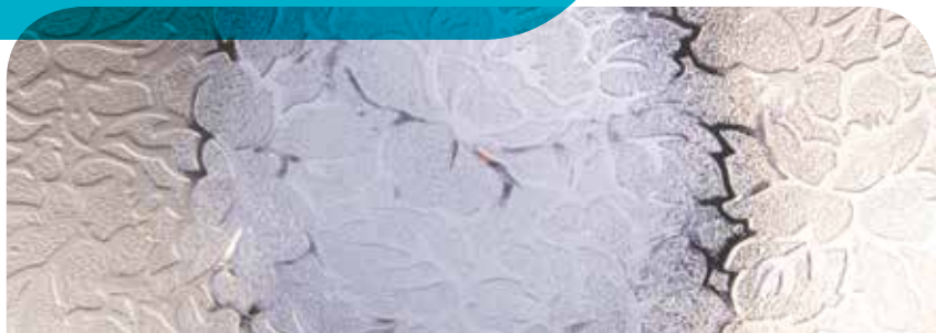
Florielle™ Privacy Level 4