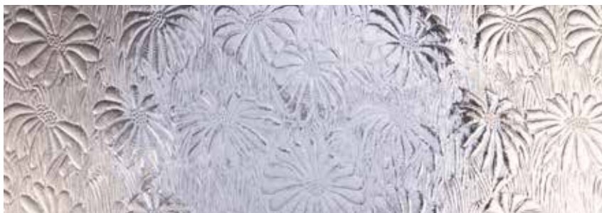
Mayflower™ Privacy Level 4