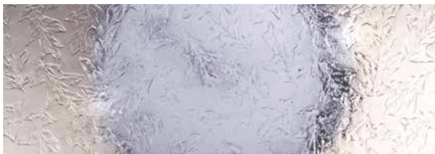
Oak™ Privacy Level 4