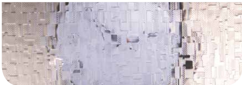
Digital™ Privacy Level 3