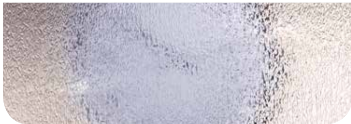
Contora™ Privacy Level 4