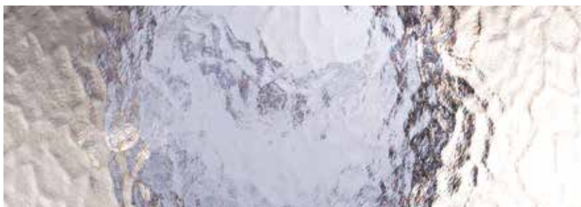
Minster™ Privacy Level 2