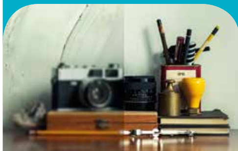
Privacy Level 1