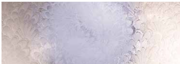
Pelerine™ Privacy Level 5