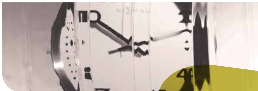
Warwick™ Privacy Level 1

To discover more about the use of Warwick™ please visit our website