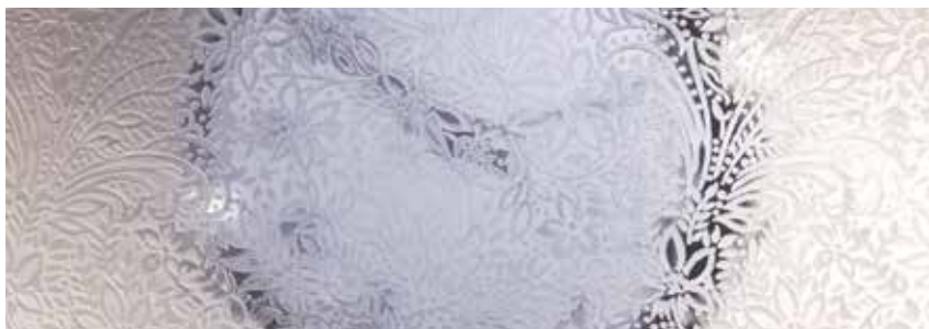
Chantilly™ Privacy Level 2