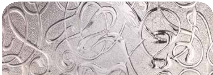
Everglade™ Privacy Level 5

Choose from a wide range of great Pilkington designs