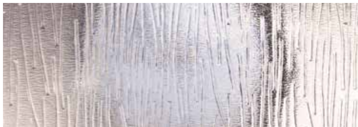
Charcoal Sticks™ Privacy Level 4