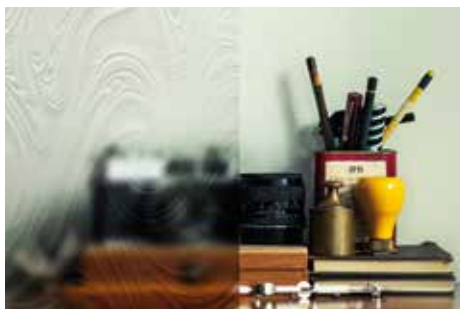
Privacy Level 3